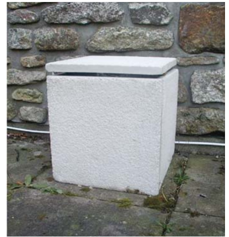
Concrete cube enclosure with top vent for a fan-assisted sump system

If budget constraints are not an issue then there really are no limits to the design of