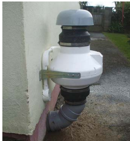
Low level fan-assisted sump system

Many homeowners would rather not see ductwork at all. In this case, it may be possible to install a low level exhaust outlet to terminate around half to one metre above ground. However, it is important that these outlets are not adjacent to any opening portals such as doors or windows, to avoid the possibility of radon gas venting directly into a property.