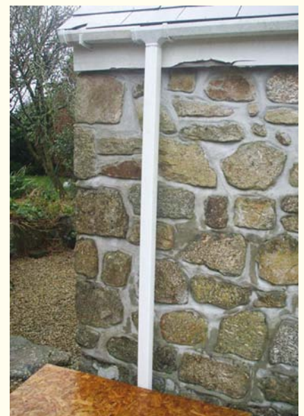
Fan-assisted sump system outlet concealed in false guttering and downpipe as an extension to the genuine gutter system (The board at ground level is simply covering the installation during construction)

Overall, whatever the householder's requirements, they can usually be met by an imaginative and innovative approach by the remediation specialist.