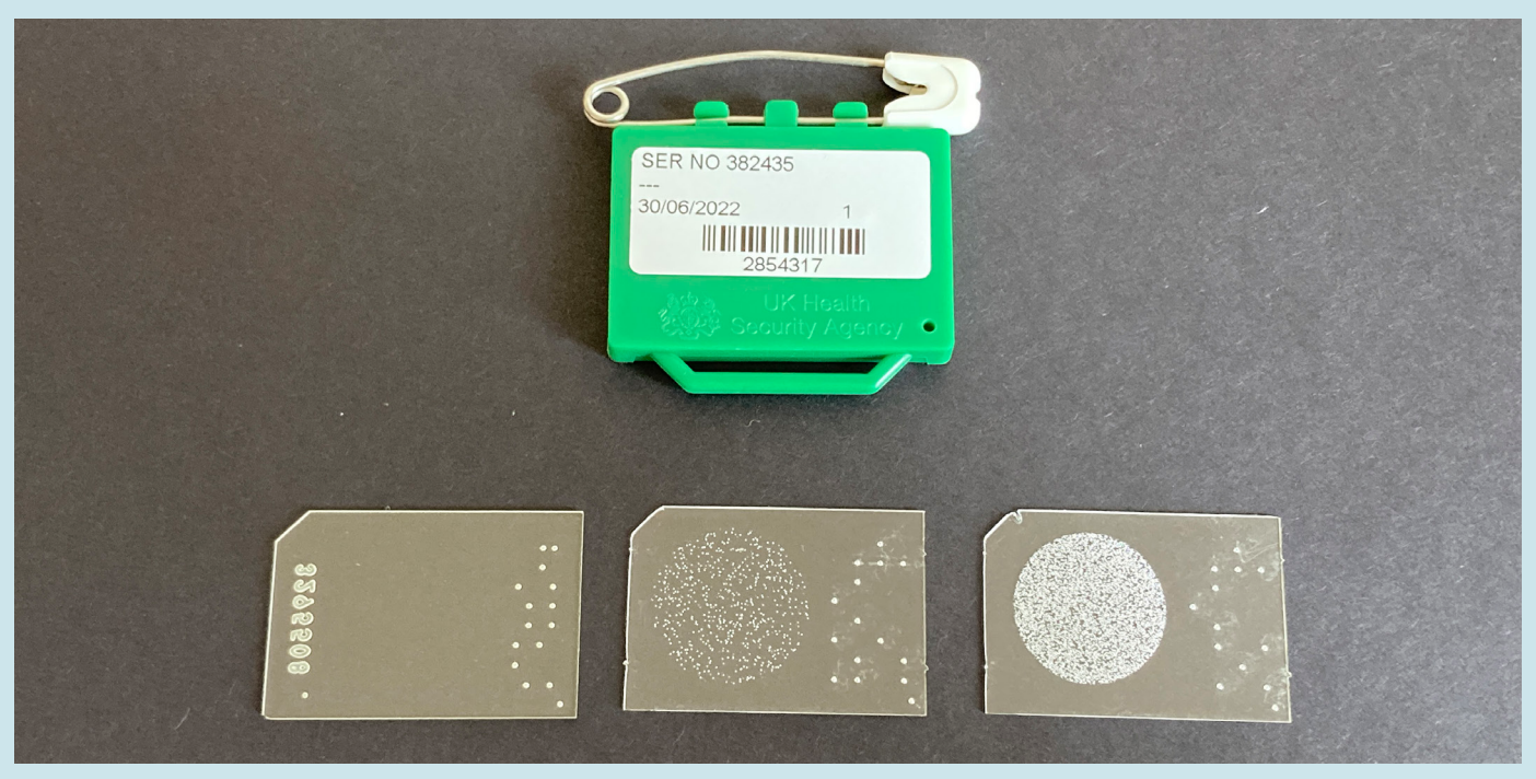
PADC dosemeter top, PADC plastic below, before and after processing

Neutrons from about 144 keV upwards are detected by direct collisions with nuclei in the dosemeter/ holder assembly, whilst the detection of thermal neutrons utilises capture interactions with nitrogen nuclei in the nylon holder. This enables the detector to detect neutrons over a very wide energy range.